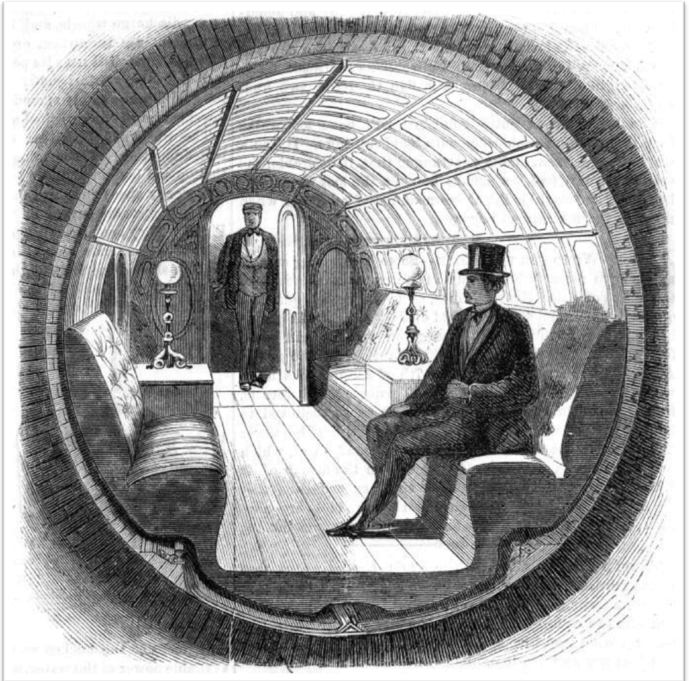
“Interior of the pneumatic passenger-car,” 1872.

Alfred Ely Beech was an inventor who built New York’s first underground railway below Broadway in 1870. It was a pneumatic, or air-powered, train; it used a huge steam-powered fan to blow a cylindrical train car through a brick tube at 10 miles per hour. This pneumatic train was also known as the ‘Secret Subway’, as Beach didn’t actually have the proper permission to build a subway at the time.