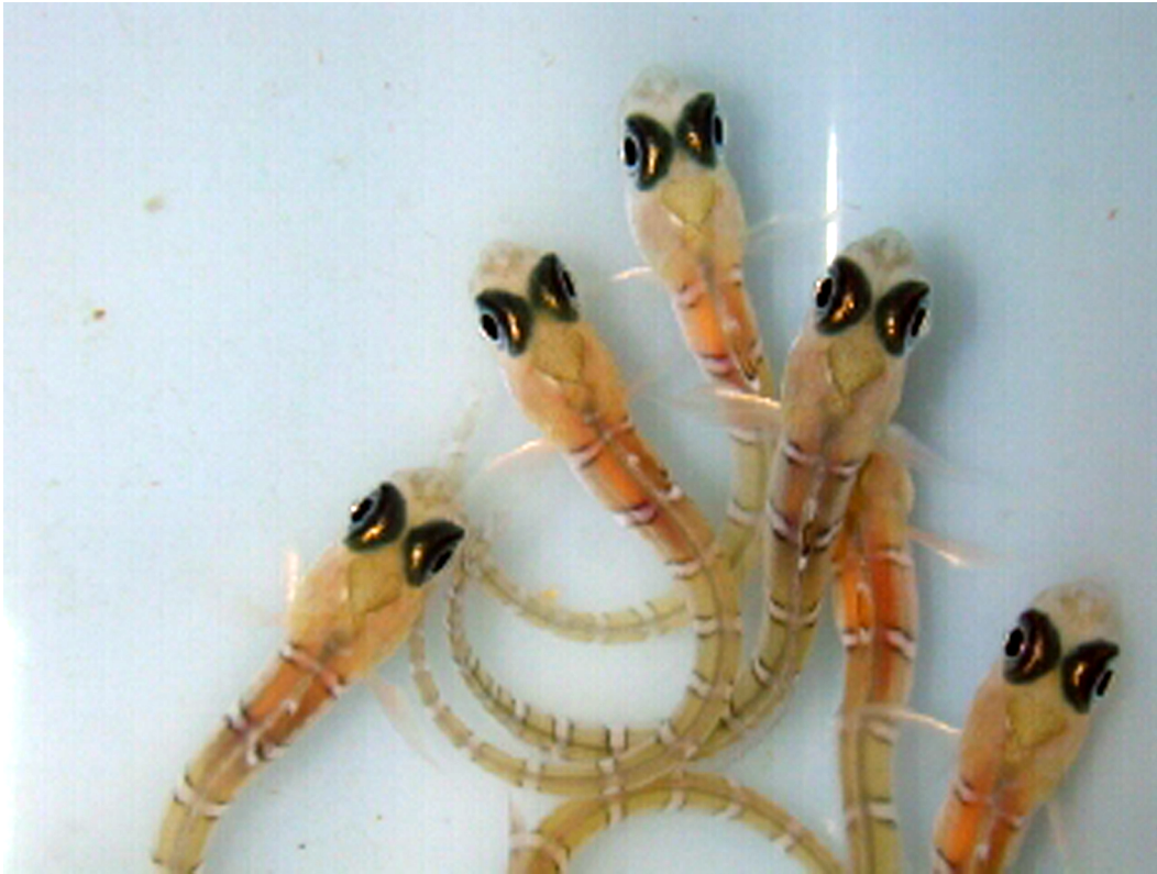
FIGURE 1. Photo of Lycopodes cortezianus hatchlings, approximately 4 cm TL, taken 27 May 2002 at 51 days posthatching.